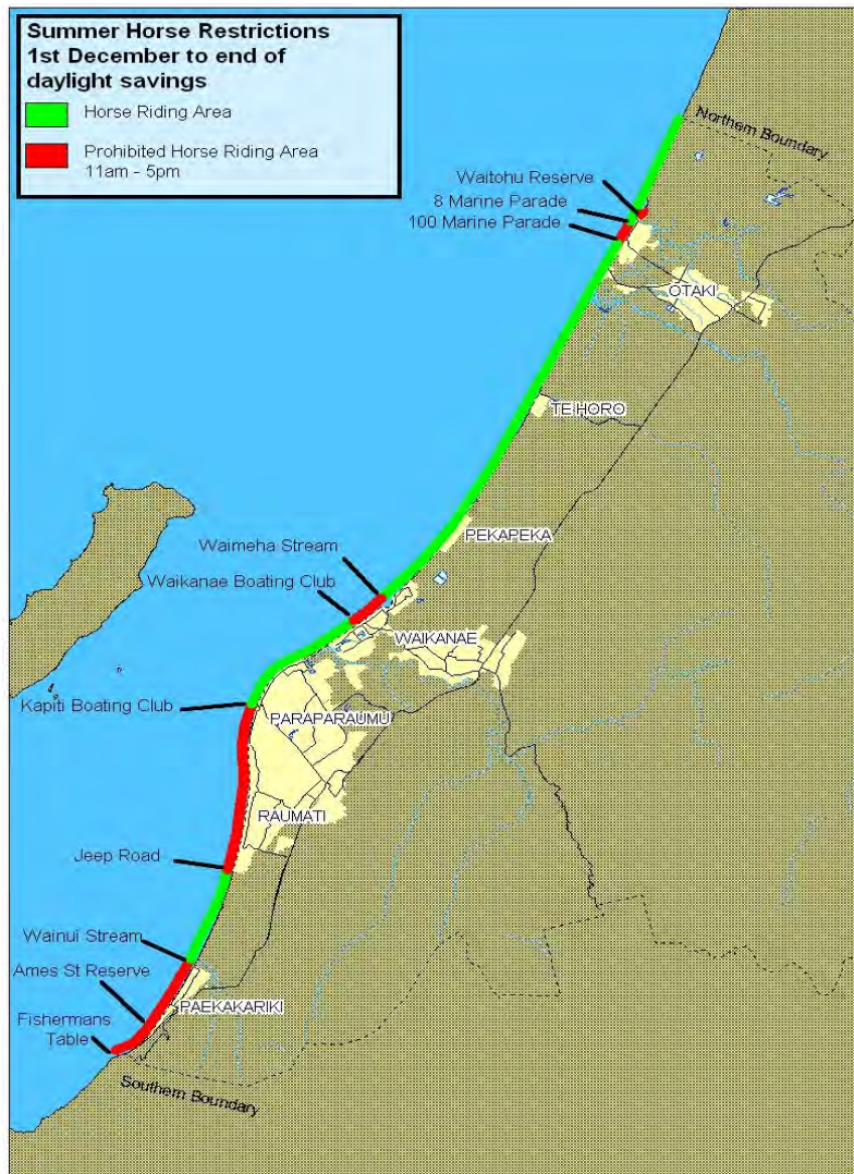
MAP 2: Horse Summer Zone Restrictions on the Beach