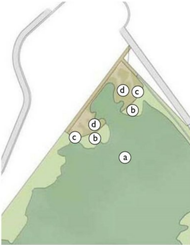
Kukutauaki Compact Development Plan Scale 1:5000@A4