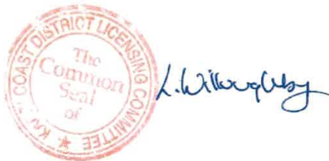
Secretary Kapiti Coast District Licensing Committee

Note: This certificate replaces certificate number 45/CERT/224/2018 issued on 24 September 2019 at Paraparaumu by the Kapiti Coast District Licensing Committee